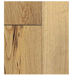
White Oak Natural