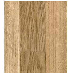
White Oak 3 Strip