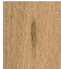
White Oak Plank