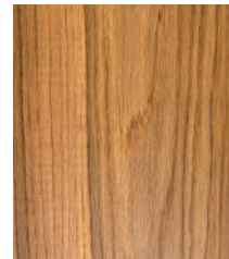
White Oak Plank (Oiled)