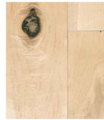
Maple Mill Run (Prime also available)